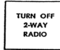
About 42" x 36"

(4) Ensuring that mobile radio transmitters which are less than 100 feet away from electric blasting caps, in other than original containers, shall be deenergized and effectively locked;